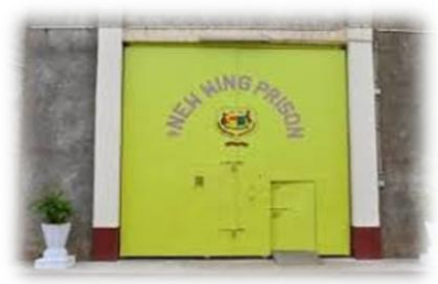
New Wing Prison (NWP)

The detainees are also provided Methadone Substitution Therapy and Antiretroviral Treatment.