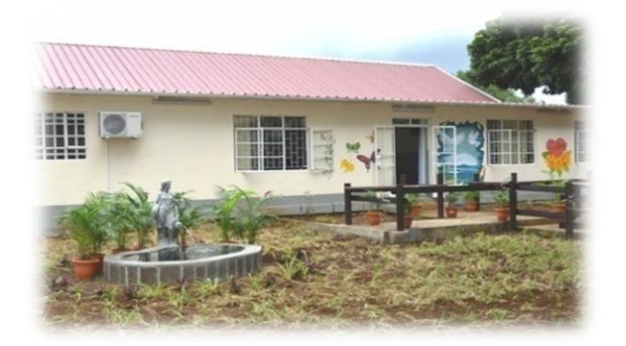
Correctional Youth Centre (CYC) Girl

Female detainees committing aggravated prison defaults at Women Prison are temporarily segregated there. It is a Segregation Unit and female detainees who pose a potential threat to the security of Woman Prison are kept there.