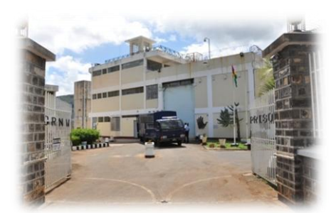
Grand River North West Remand Prison (GRNWRP)

Detainees are provided training in Pastry, Beauty Care, Basket and Rattan Wares, Garment Making, Embroidery and Vegetable Cultivation/Bio Farming.