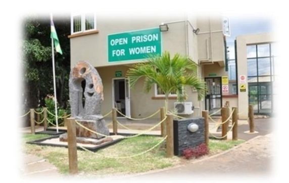
Open Prison for Women (OPW)

The Correctional Youth Centre also provides facilities to juveniles to follow educational and vocational training. Likewise, the inmates also benefit from religious facilities.