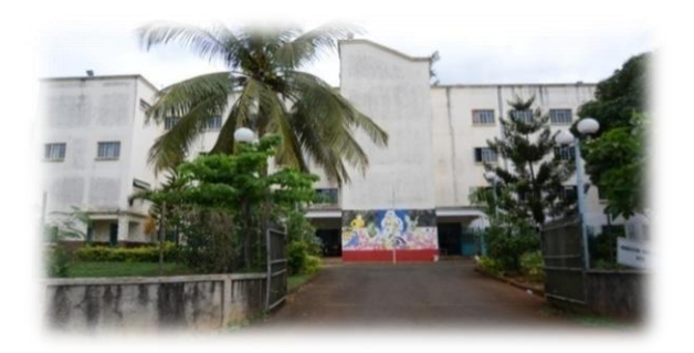
Rehabilitation Youth Centre (RYC) Boys

The Correctional Youth Centre for girls also situated at Barkly Beau Bassin keeps in safe custody female offenders up to the age of 18 years. The institution can accommodate up to 14 Juveniles. It provides opportunities for juveniles to follow educational and vocational courses along with religious facilities.