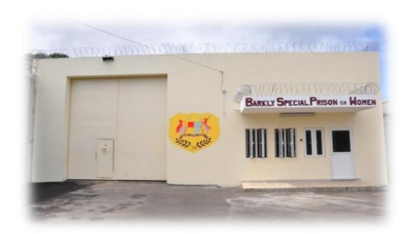
Barkly Special Prison for Women (SPW)

Barkly Special Prison for Women started operating as from 09<sup>th</sup> January 2020. It is a Maximum Security Prison and has a housing capacity of 12 female detainees.