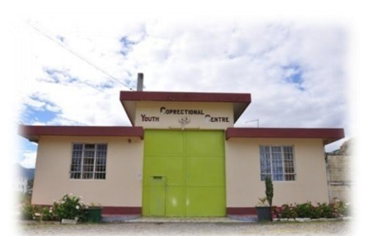
Correctional Youth Centre (CYC)

The Correctional Youth Centre Boys previously known as Borstal Institution became operational on 30<sup>th</sup> June 1987. It can accommodate up to 50 juveniles. It caters for young offenders up to the age of 18 and is situated at Corner Sir Francis Herchenroder and Pope Hennessy Street, Beau Bassin.