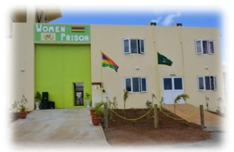
Women Prison (WP)

The Women Prison is a Maximum Security prison catering for both remand and convicted adult female detainees. It is located adjacent to the Beau-Bassin Central Prison.